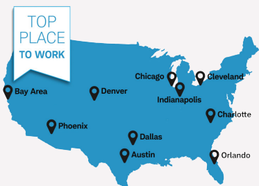
Top Workplace in our major markets

Learn more at www.aboutschwab.com/citizenship